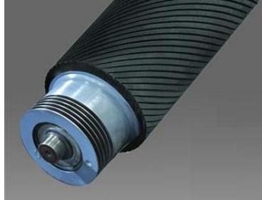
Calibrating drum: Ø115mm