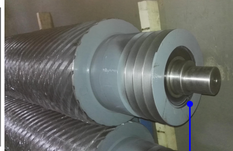
Excentric contact drum: Ø190mm